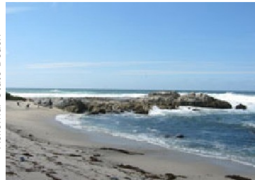
Asilomar State Beach

T he beautiful Monterey Peninsula provided the backdrop for the annual Centers for Spiritual Living summer conference, where we spent a wonderful week at the spectacular ocean side Asilomar Conference Center.